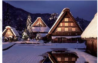
Shirakawa-go ～白川郷～ 55+50 minutes by bus.