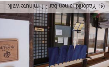
④ Yadoriki ramen bar : 1-minute walk