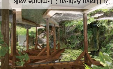
② Hirayu Ashi-yu : 1-minute walk

Hirayu hot spring Nakamura hotel 728 hirayu okuhidaoonsenkyou takayama-city, gifu-prefecture TEL +81(0) 578-89-2321 FAX +81(0) 578-89-3022