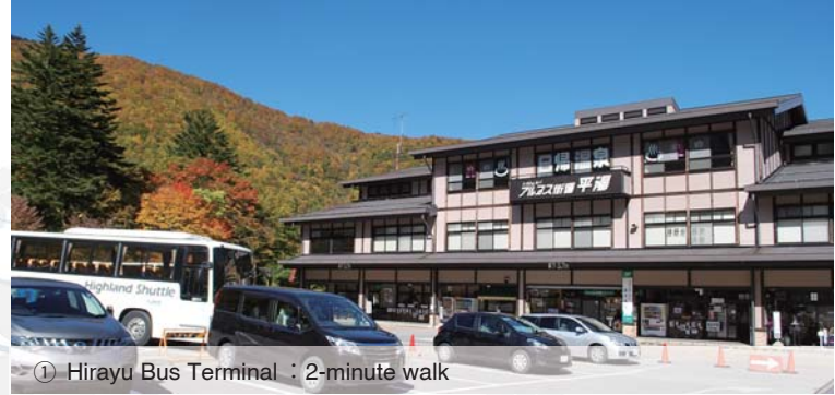
① Hirayu Bus Terminal : 2-minute walk

Including Hida Takayama and Shirakawa-go of the world's cultural and natural heritage which make Japanese history feel, it's very convenient for access to Kamikochi, Norikuradake and Shin-hodaka grand nature goes trekking and where can be enjoyed fully.