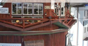
③ Cafe Mustache : 1-minute walk