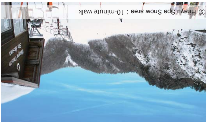
⑤ Hirayu Spa Snow area : 10-minute walk