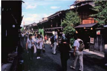
Takayama～飛騨高山～ 55 minutes by bus.