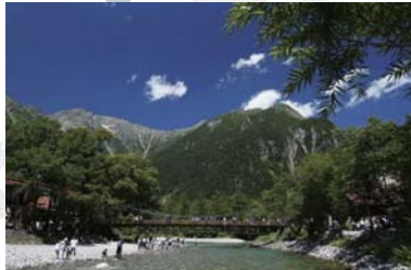
Kamikouchi ～上高地～ 25 minutes by bus.