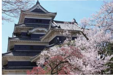
Matsumoto-castle ～松本城～ 75+10 minutes by bus.